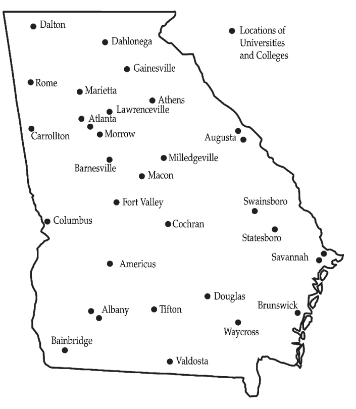
Map and Contact