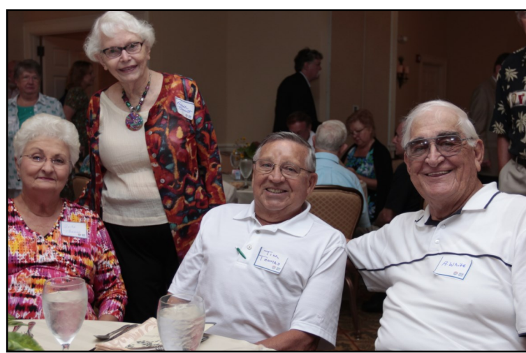
Don't Miss ARFS 2015 Reunion!