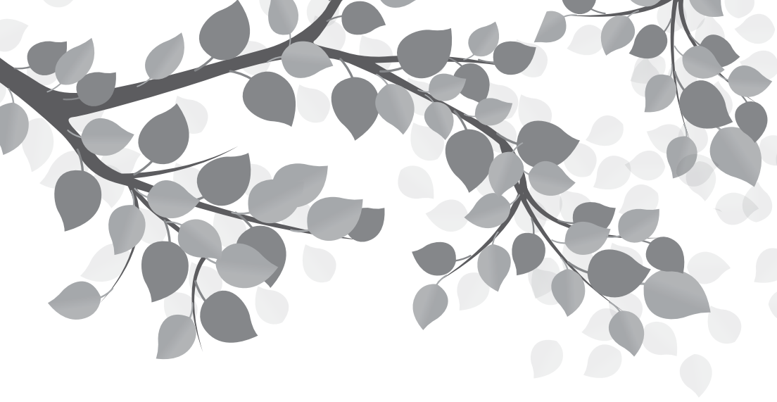
UNIVERSITY OF WEST GEORGIA